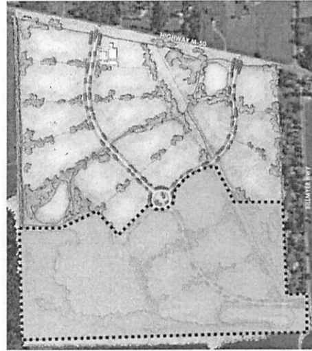
Phase 3 - Undeveloped Area