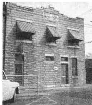
Old City Jail and Police Station at rear of Fire House and City Hall.