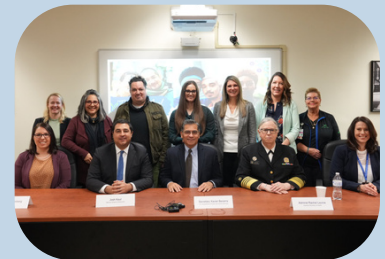
Secretary Becerra & Admiral Levine Visit

The visit highlighted the work we do to promote health education & provide reproductive health care.